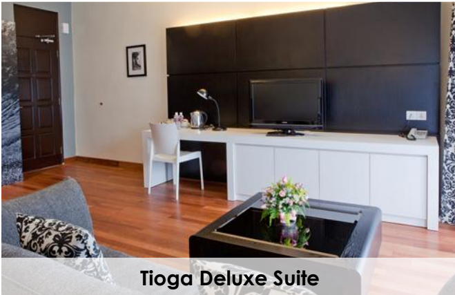
Tioga Deluxe Suite